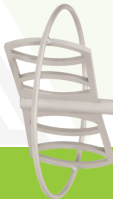
Stainless Steel Blade 6" x 2-3/4" x 3/16"