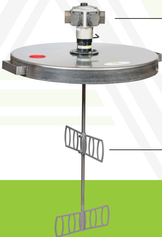
1 HP Radial Piston Motor